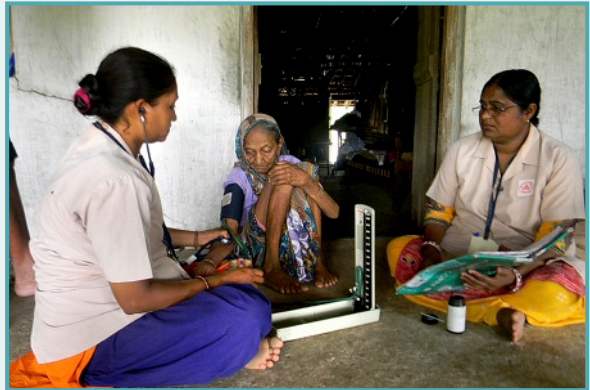
Door to Door Screening of elderly in Geriatric Project