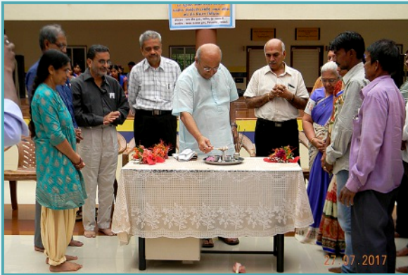
Inauguration of Satellite centre at Shivarimal Dang