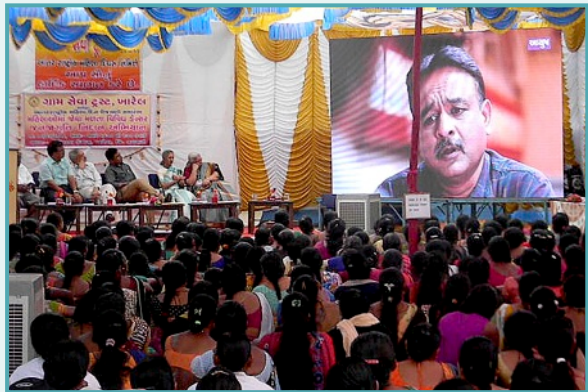
International Women's Day Celebration