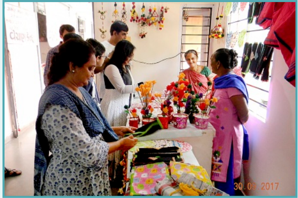
Annual Exhibition cum Sale of Handicrafts and Household Products