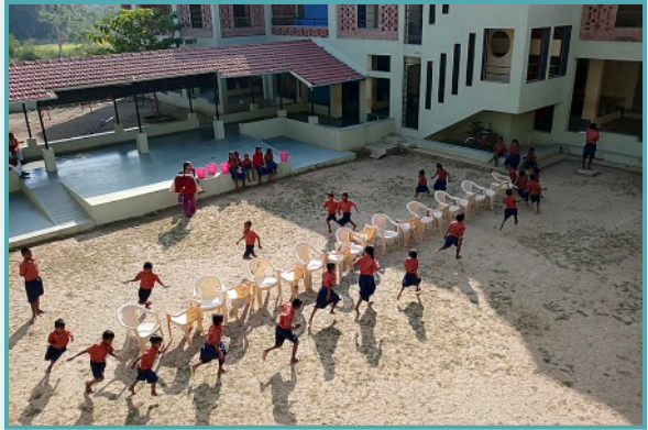
Sports Day in Parodh Balawas