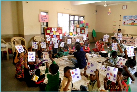
Art and craft activities in Balmela for Village children