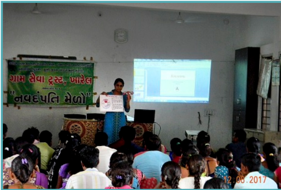
Newly Married Couple Workshop