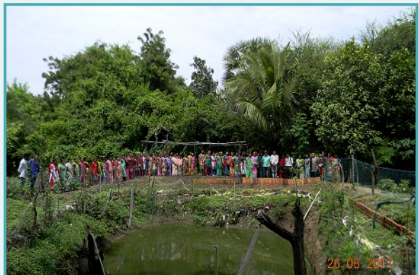
Exposure Visit for Nutrition Garden Project Participants