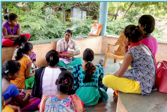
Breast Feeding Week- Health Awareness Session