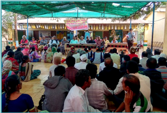
General Medical and Surgical Camp at Zhavda, Dang